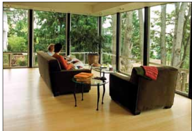
Figure 2 Contemporary craftsmanship with artful living—in both form and function—offer low-impact, reduced carbon footprints with expansive views in the Case-designed home

For more information about thermal barriers, contact the AZO/Tec® technical services department: azotec@azonusa.com .