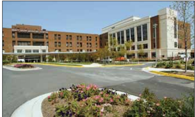
Figure 1 Shady Grove Adventist Hospital New Patient Tower, Rockville, Md.

Beyond the structural and longevity factors, aluminum and the glazing that lets in daylight need improvement to be viable energy conservators. At the same time, studies are ongoing about the effects on health of excessive water vapor and interior air quality.