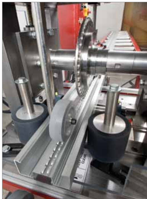
Figure 3. Lancer™ for producing mechanical locks

The lancing wheel travels along the lugs to produce lanced indentations that bend down into an extrusion cavity.