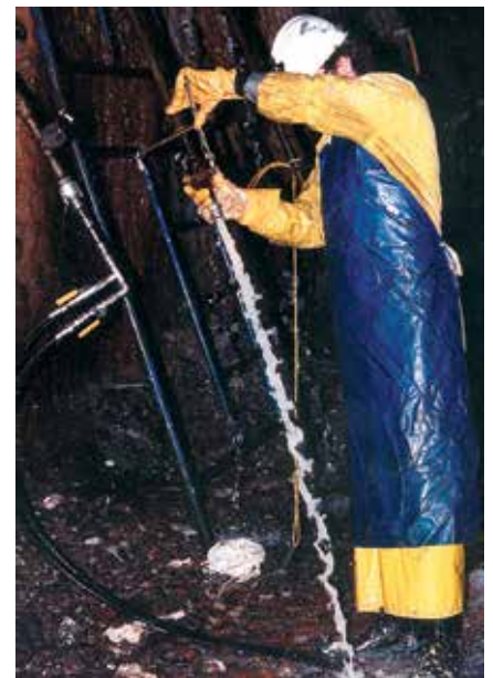
Azo-Grout™ being used in a gypsum mine with a multi-ratio pump.

For crack repair, soil stabilization or stopping the infiltration of water in any concrete, brick or mortar infrastructure, the Azon line of Azo-Grout products will provide the solution you need. Depending on the product option and application, Azo-Grout effectively diverts water or converts sandy soils into a solid mass by forming an elastomeric solid material, a rigid or flexible foam, or a gel-type substance. With additional benefits that include low viscosity, low flammability and solvent-free systems, Azo-Grout is the product of choice that puts safety first—even meeting the approval of ANSI/NSF 61 for use with potable water.