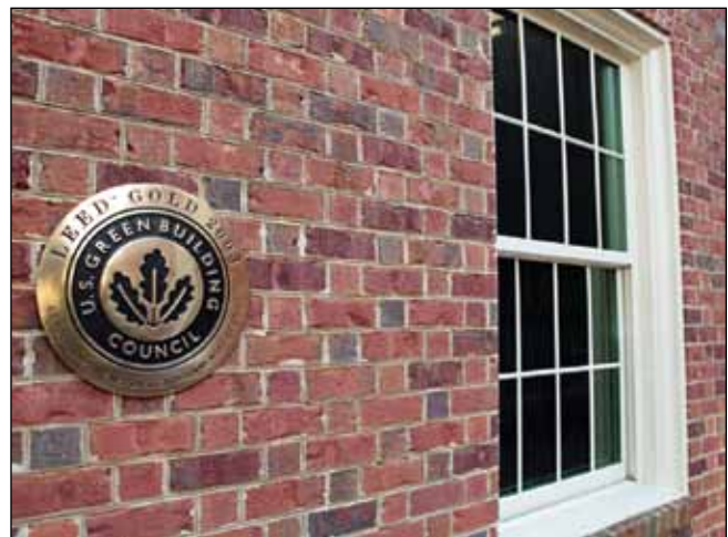
Figure 2 Completed in 2003, Hipp Hall at Furman University in Greenville, SC., achieved a “Gold” LEED rating, the first building in the state to receive this certification.

As a private liberal arts university, nationally acclaimed for its academic excellence and campus beauty, promoting sustainability in construction practices is just one facet of the university’s strategic plan, which embraces innovation and improvement. The other facet is lowering energy costs, something that Hipp Hall has already done, saving Furman University about $80,000 since it was completed.