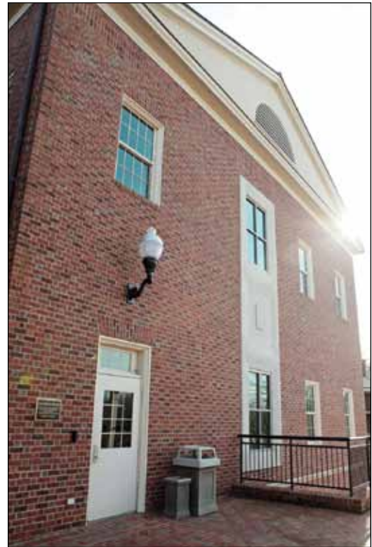
Figure 1 The energy savings for Hipp Hall is roughly 30% compared to a similar building on campus saving the university approximately $12,000 per year.